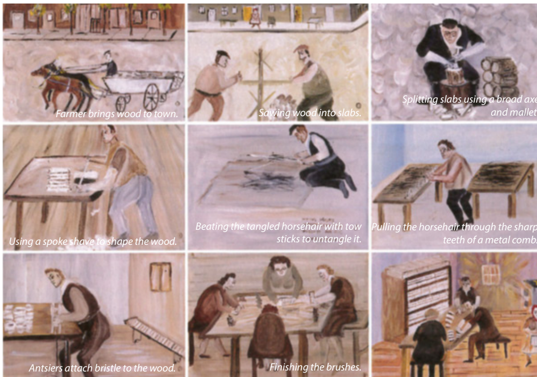
Picture 3: How to make a brush (Kirshenblatt Mayer, Barbara Kirshenblatt-Gimblett, They Called Me Mayer July , Canada 2007, p.163)

In the XIXth century Opatów was still one of the biggest and most important Jewish communities. The statistics show that at that time there were from 2,5 to 2,9 thousand Jews only in town, which was 60% of all the inhabitants of Opatów. There were a synagogue, a cemetery and a prayer house.