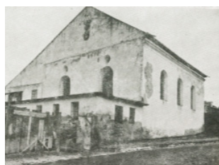
Picture 2: The XVIth - century synagogue on Żydowska Street (Szeroka Street at present) destroyed in 1944

In the second half of the XVIth century Opatów was the biggest cluster of people of Mosaisc faith in the Sandomierski Province and one of the main kahals of Lesser Poland.